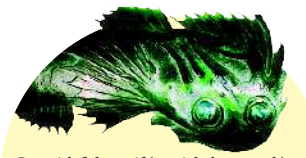
Cup with fish motif (partial photograph) Émile Gallé, France, 1895–1904 Kitazawa Museum of Art