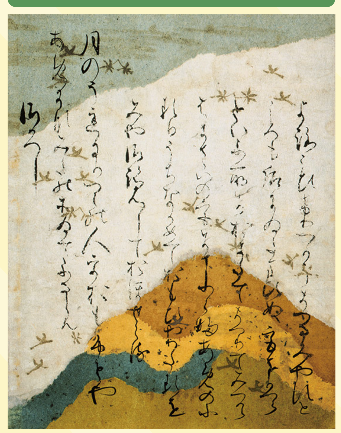
Manuscript fragment of the Iseshū poetry anthology ( Ishiyama-gire ), Tōyama Memorial Museum, Saitama