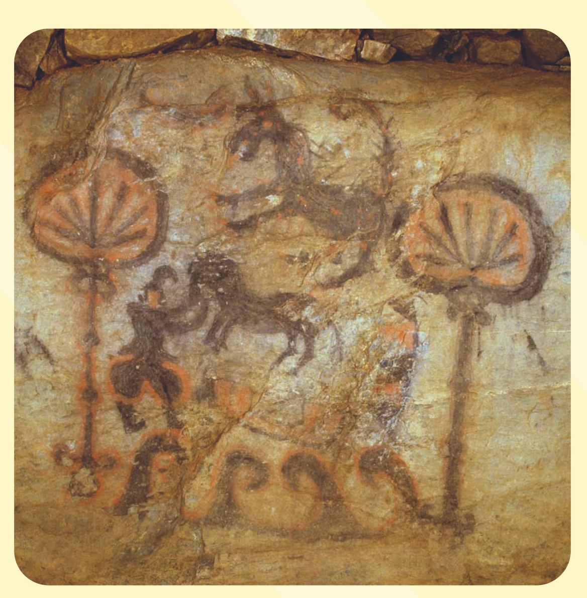
Takehara tumulus, Miyawaka City, Fukuoka Prefecture

Kofun tombs refer to huge burial mounds that were constructed across Japan from the third to the seventh century – what we now call the Kofun period! While these iconic tombs – tumuli – are perhaps best known for being shaped like keyholes, they actually come in all sorts of shapes and sizes; some even feature striking paintings on their inner walls. These decorated tumuli are especially prevalent in the Kyushu region, where our museum is located.